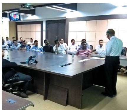
IT Security Awareness Session in Mumbai office