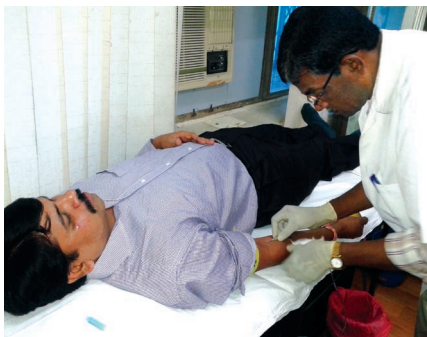
Blood Donation Camp in Mumbai office