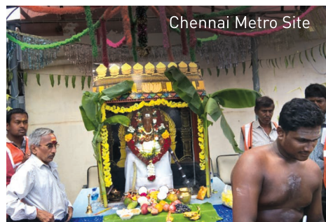
Ganesh Pooja Celebration