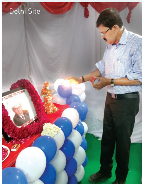
Engineer's Day Celebration