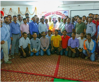
Engineers Day Celebration at ALEP PKG IV 4545 on September 15, 2016