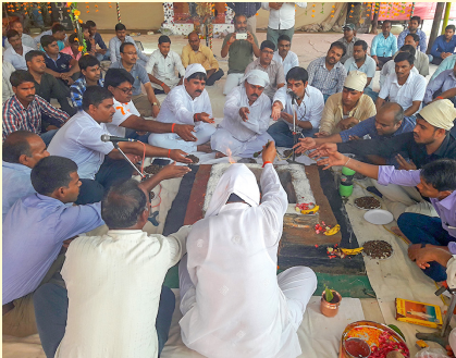
Vishwakarma Pooja at ALEP PKG IV 4545 on September 17, 2016