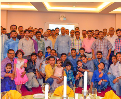
Engineers Day Celebration at KNPC 5712 on September 15, 2016