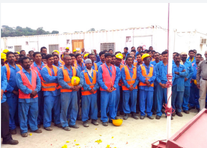
Independence Day celebrations at the Gabon site