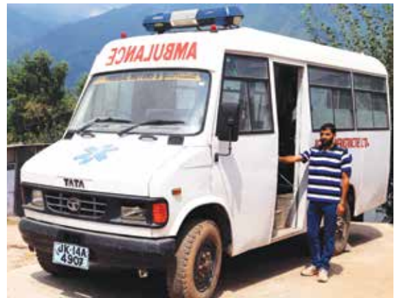
A HOMELY FEELING: Most kids from the villages go to school but some help in farming from an early age too; (below) Villagers make use of the company ambulance whenever a medical need arises

AFCONS is now like a second home. Our interpersonal skills have improved after interacting with the engineers and seniors who come from other cities.”