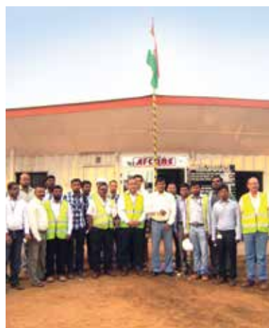
Independence Day celebration in Liberia