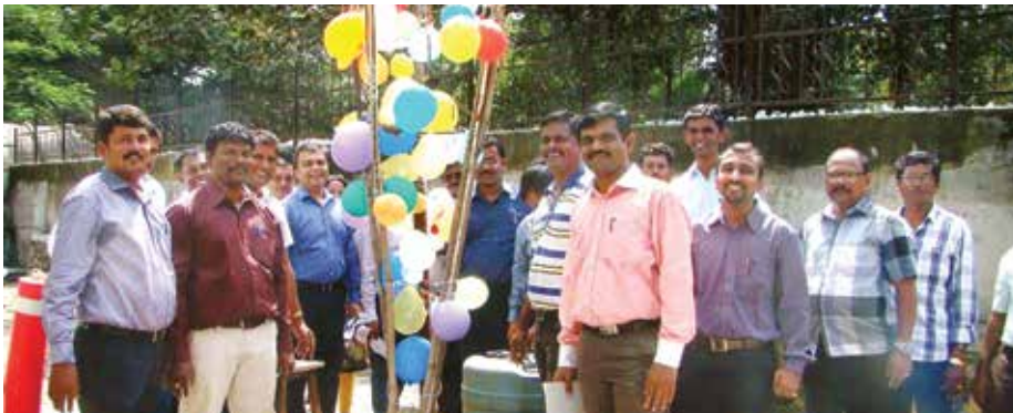
First Time Manager Training Programme held at AFCONS House, in Mumbai, from Sept 30 - Oct 1