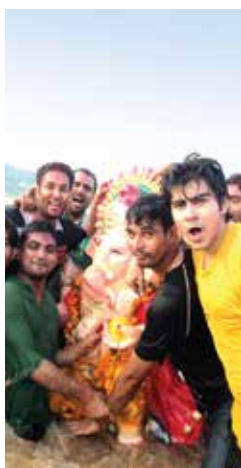
Ganesh Pooja at Jammu

As always, AFCONS kept its cultural side up with Janmashtami, Ganesh & Vishwakarma pooja celebrations. The Republic Day was also celebrated at most sites.