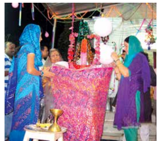
Janmashtami celebration at KRCL