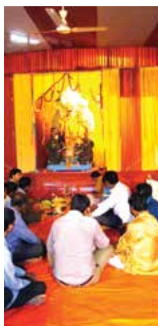
Vishwakarma Pooja at RVNL, Kolkata